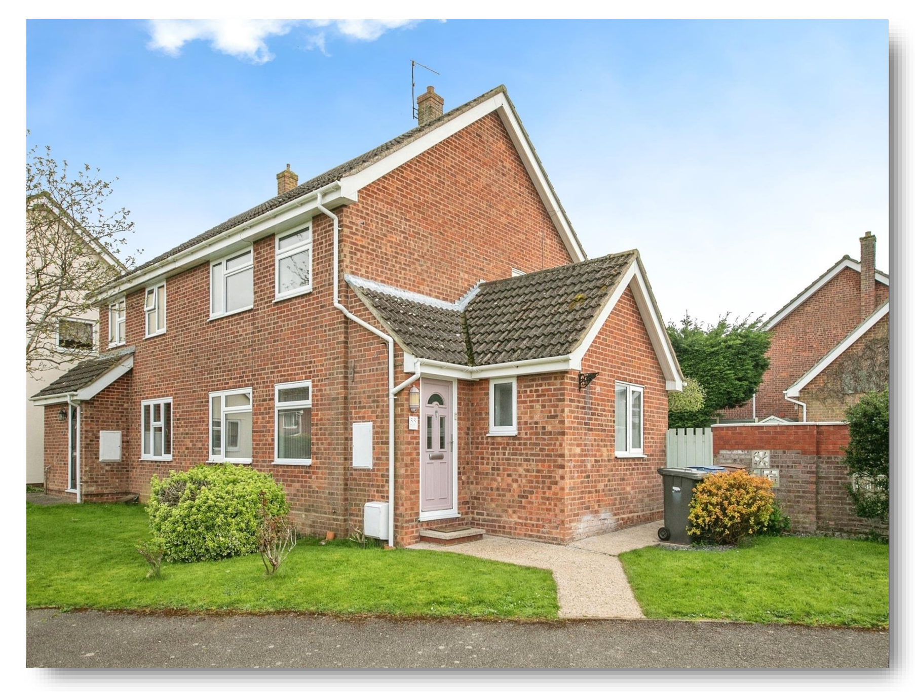
Lime Walk, Acton, Sudbury CO10 0XD