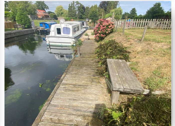
Plot Tylers Dyke, Dilham, North Walsham, NR28 9PS