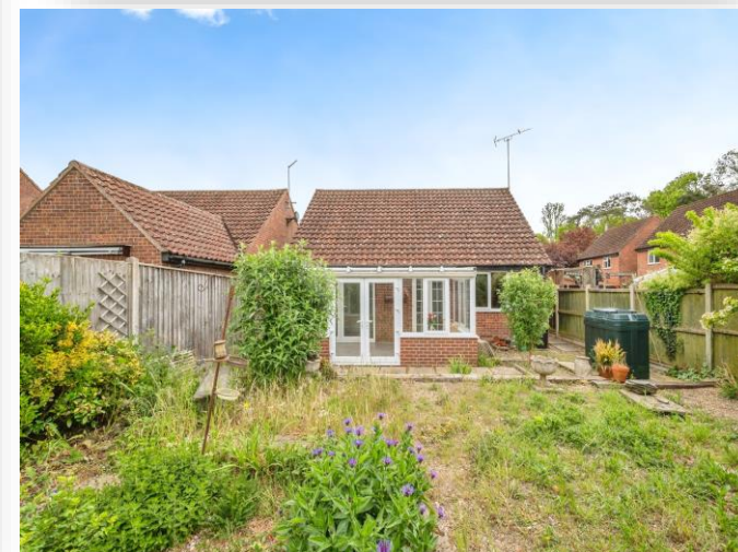
Latchmoor Park, Ludham, Great Yarmouth, NR29 5RA