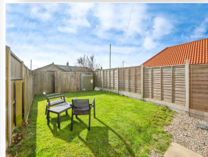
Beaucourt Place, Walcott Norwich NR12 0PH