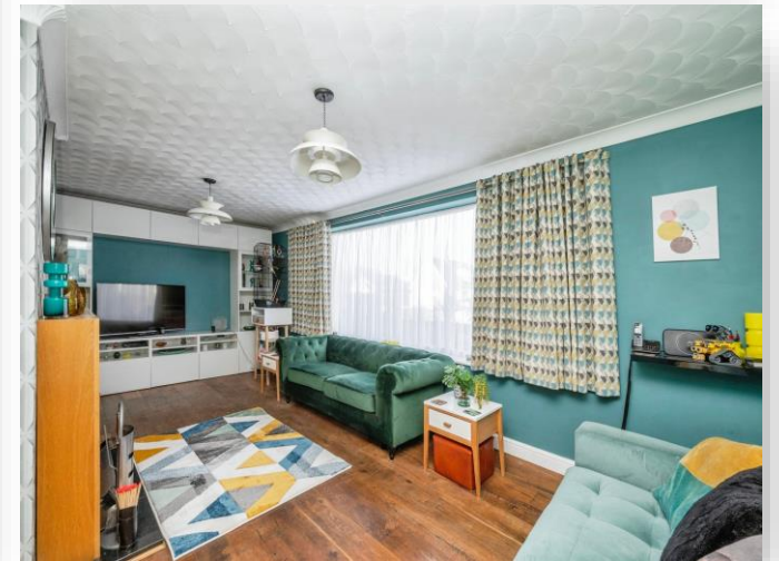
Teresa Road, Stalham, Norwich NR12 9EB