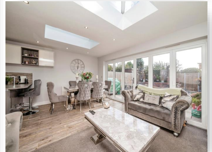
Oaktree Close, Martham Great Yarmouth NR29 4QN