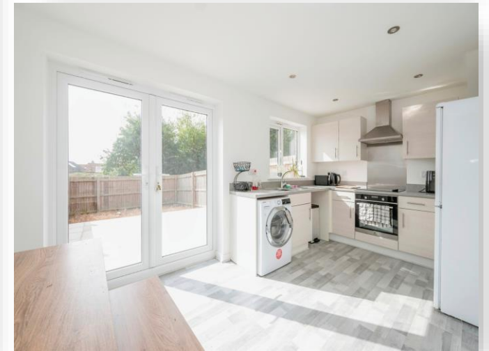
Portobello Drive, Martham Great Yarmouth NR29 4FL