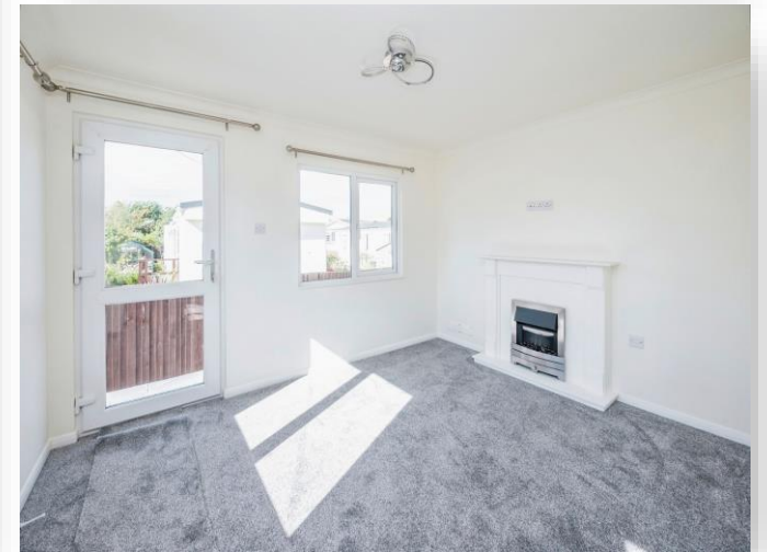
Norfolk Broads Caravan Park, Potter Heigham Great Yarmouth NR29 5JB