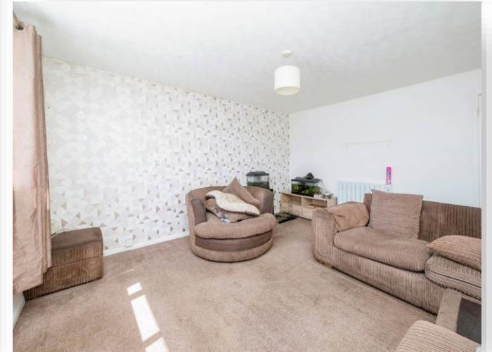
Teresa Court Camping Field Lane, Stalham Norwich NR12 9DZ