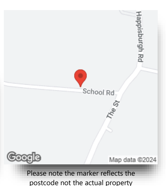
view this property online williamhbrown.co.uk/Property/NWS107986