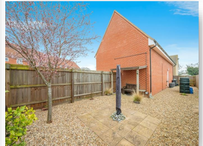
Jeckells Road, Stalham Norwich NR12 9FN