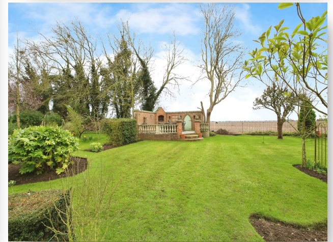
Willow Lodge Horseshoe Road, Spalding PE11 3JA