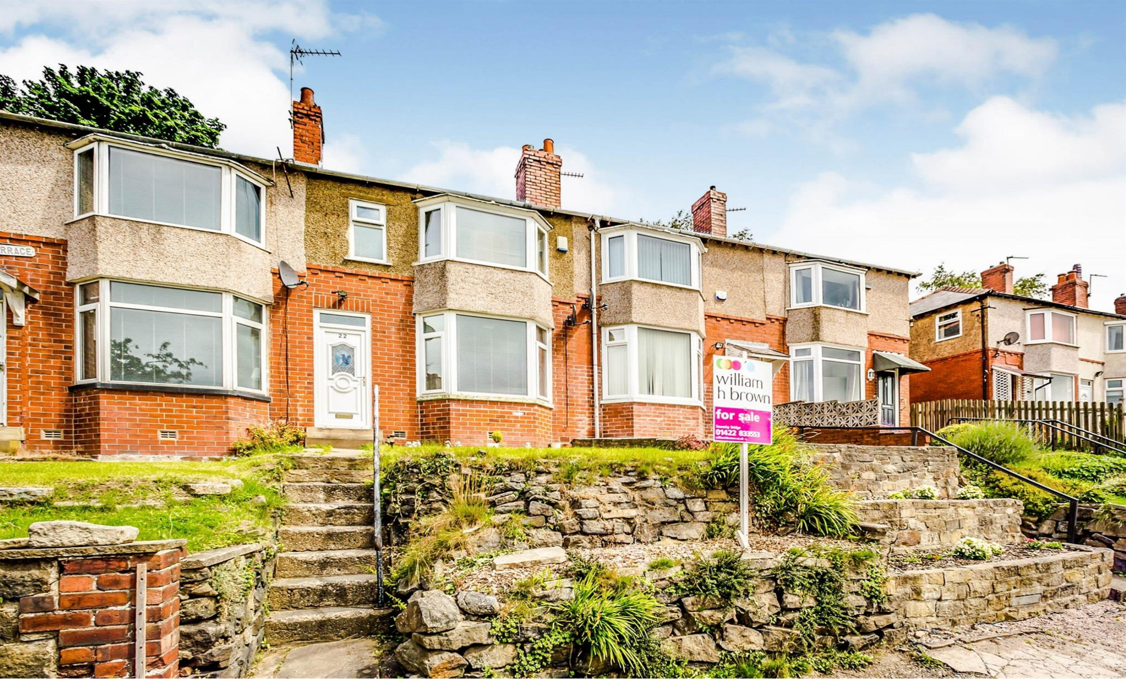
Willowfield Terrace, Halifax, HX2 7JL