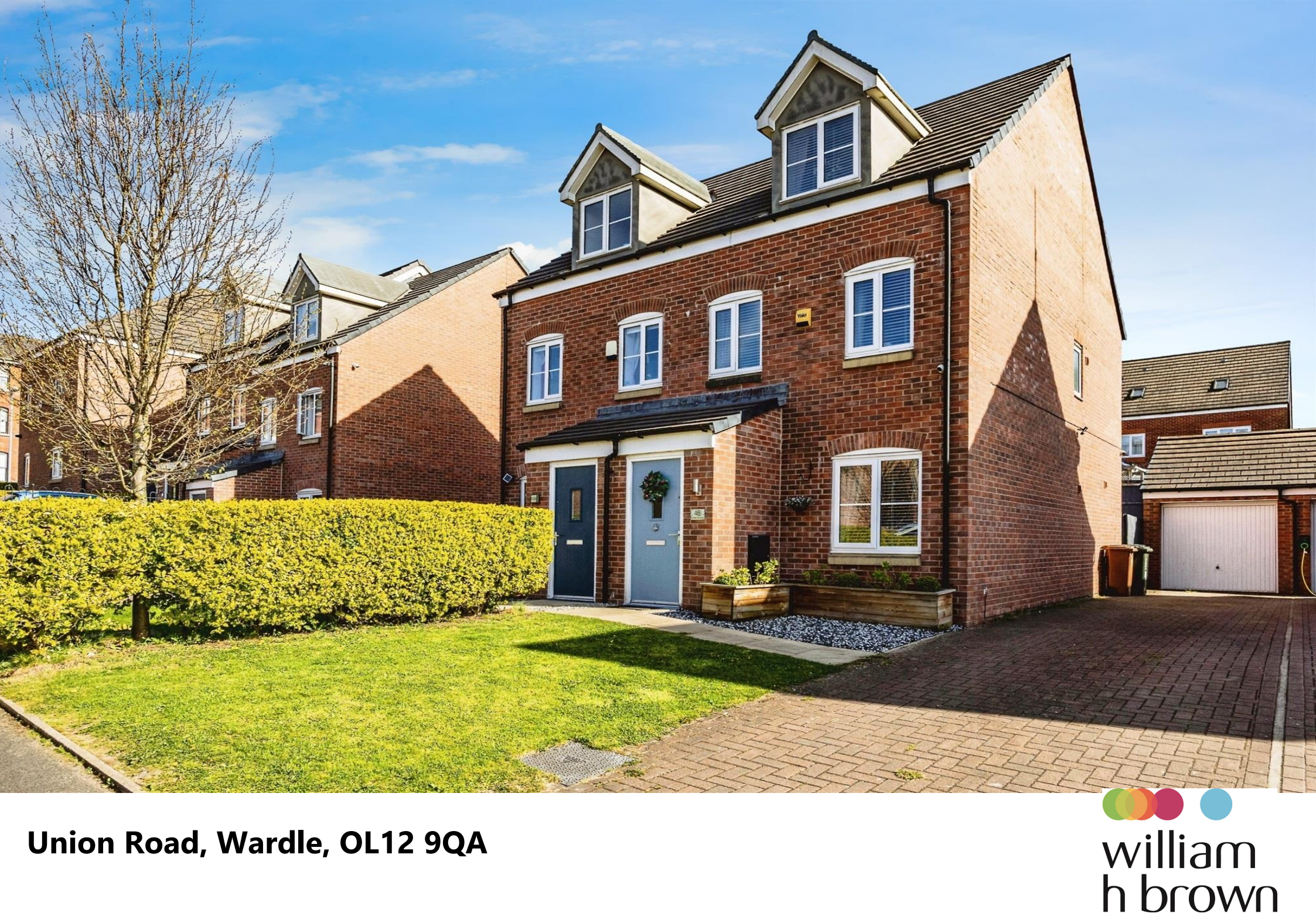
Union Road, Wardle, OL12 9QA