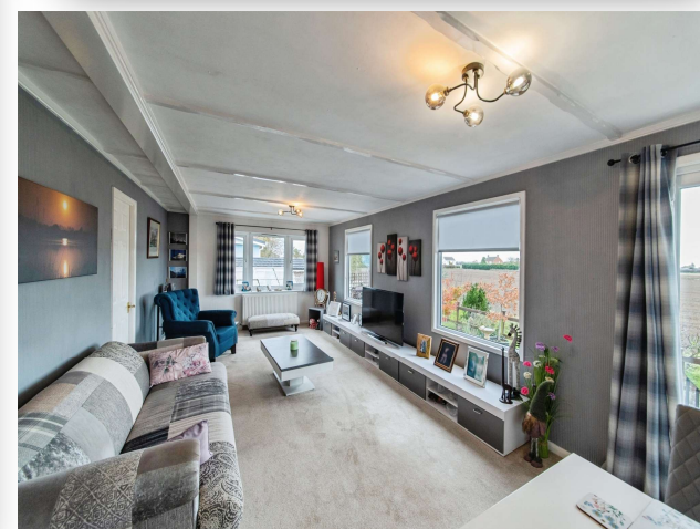
Marina View, Dogdyke Lincoln LN4 4UT