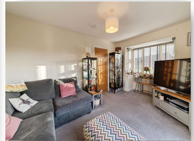
Hornbeam Close, Ruskington Sleaford NG34 9WG