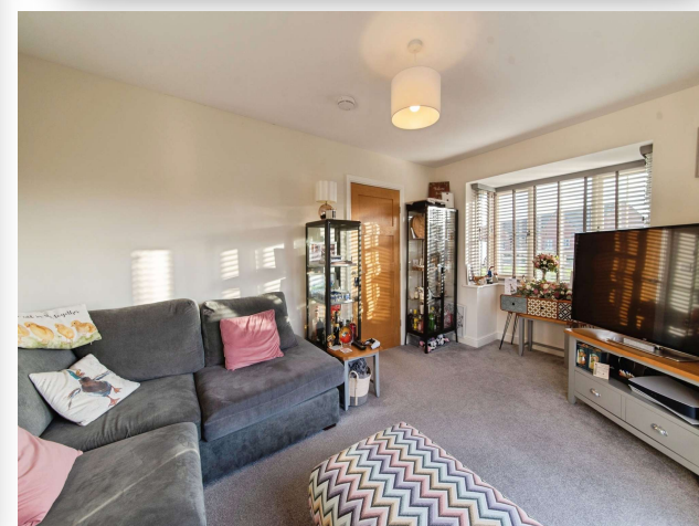
Hornbeam Close, Ruskington Sleaford NG34 9WG