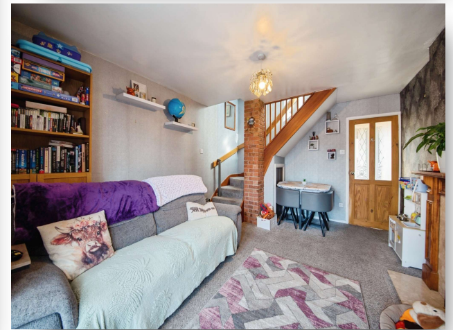
Maiden Grove, Sleaford NG34 7GH