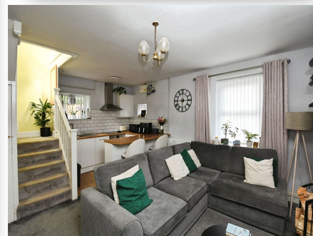
Holme Lane, Ruskington Sleaford NG34 9DN