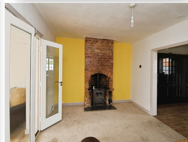
Park Lane, Billingham Lincoln LN4 4EE