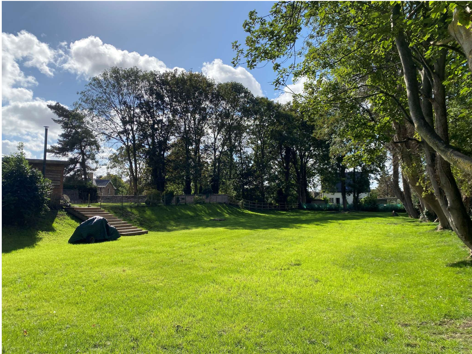
Plot At 33 Queensway, Ruskington Sleaford NG34 9EX