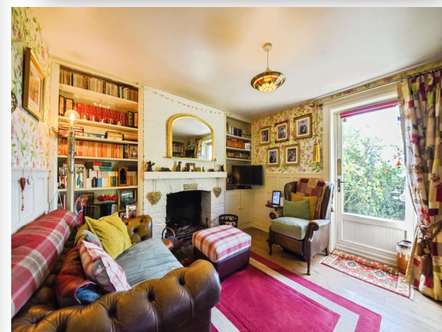
Beck Cottage North Beck, Screddington Sleaford NG34 0AD