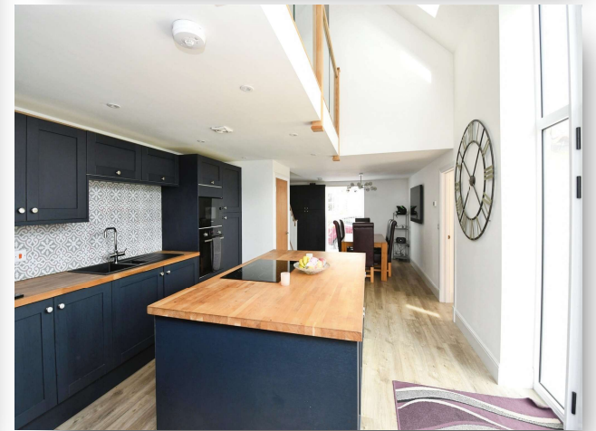
The Brambles Highgate, Helpringham Sleaford NG34 0RD