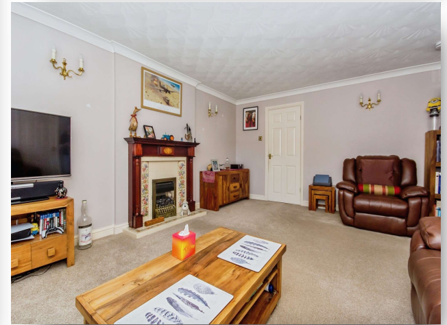
Meadowbrook, Ruskington Sleaford NG34 9FJ