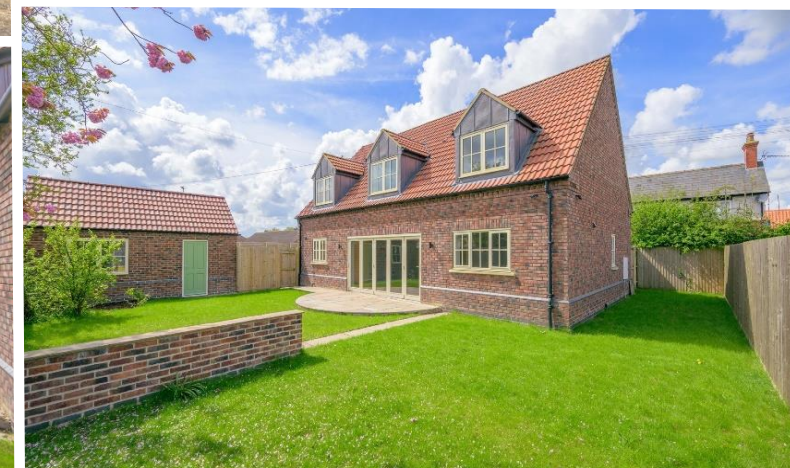
Woodcroft House, High Gate, Helpringham Sleaford NG34 0RD