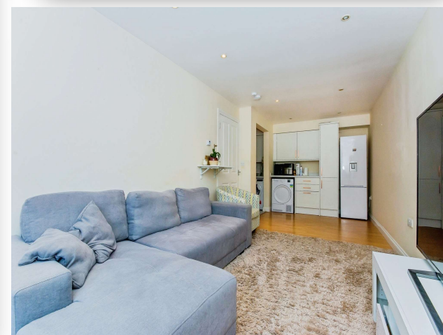
Grosvenor Mews, Billingborough Sleaford NG34 0PT