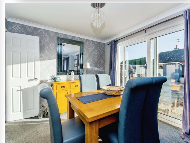
Finney Close, Coningsby Lincoln LN4 4JY