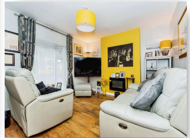
Eastgate, Heckington Sleaford NG34 9RB