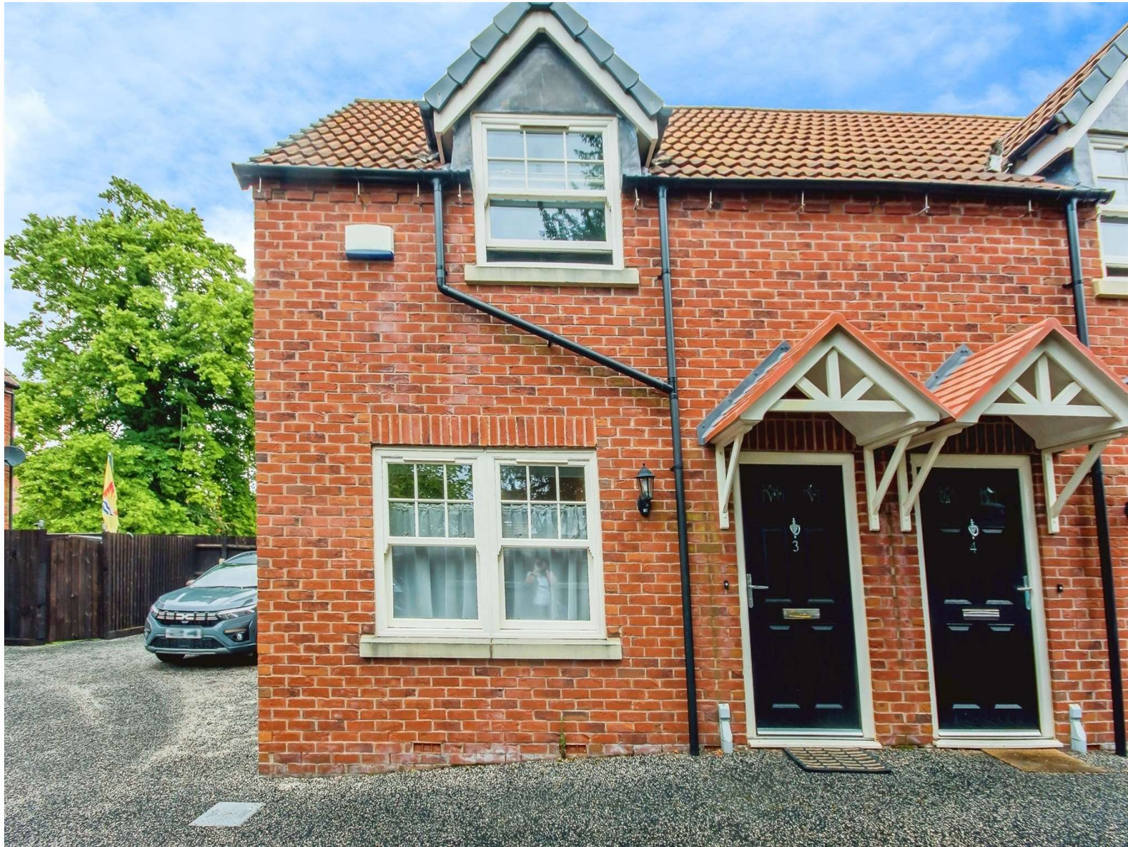
Wesley Court, Billingborough Sleaford NG34 0UJ