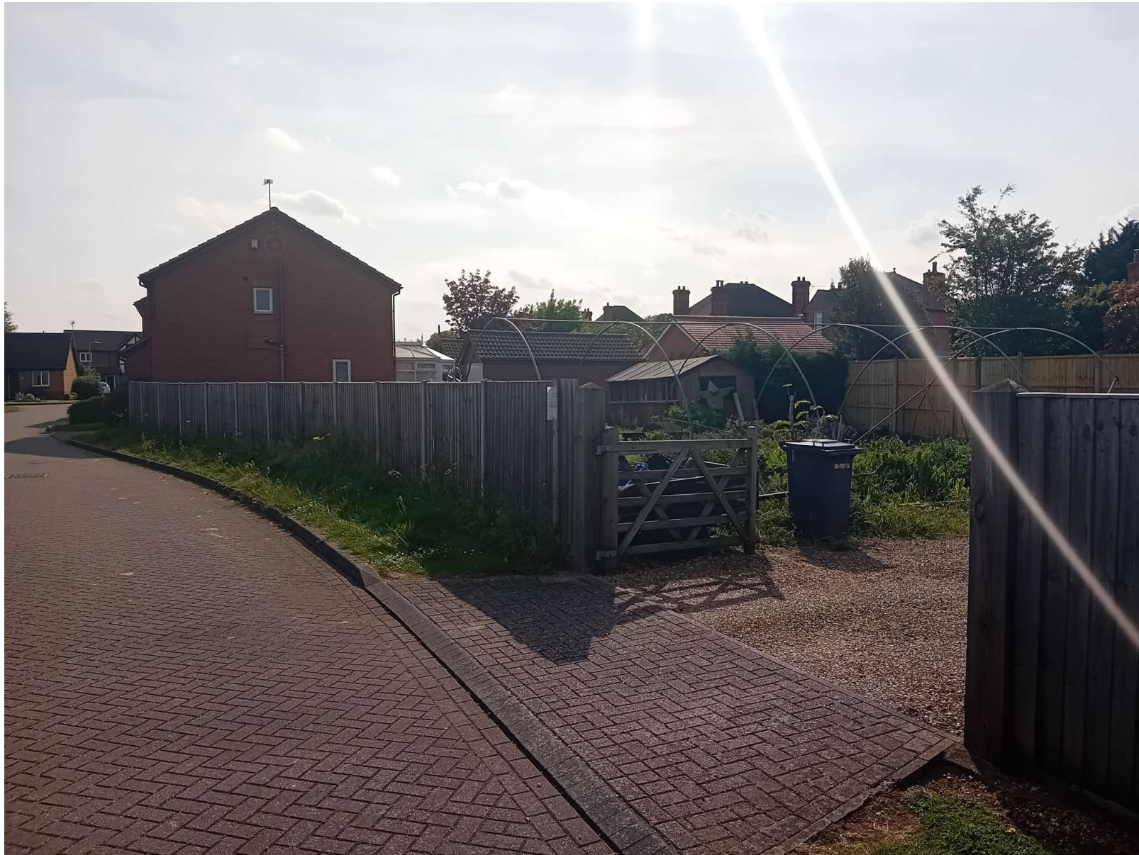
Land At Nursery Court, Sleaford NG34 7RH