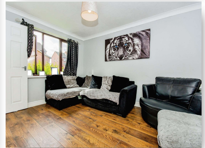
Castle View, Walcott Lincoln LN4 3TB