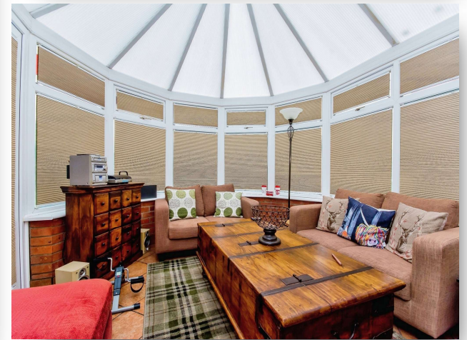
Hall Close, Heckington Sleaford NG34 9SF