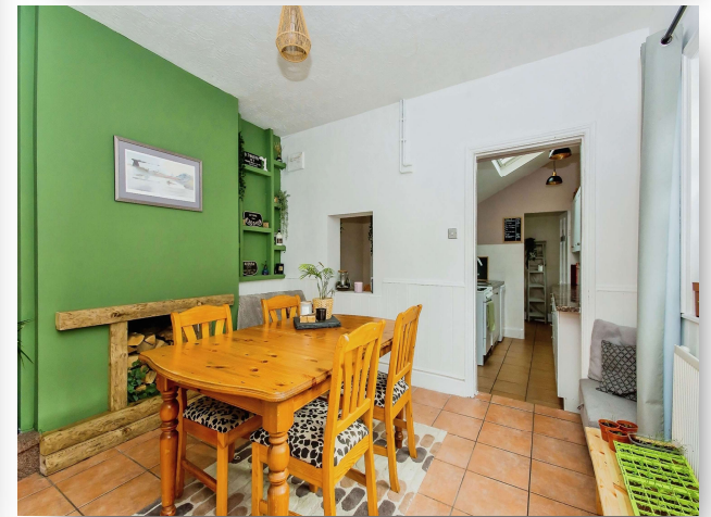
Alexandra Terrace, Woodhall Spa LN10 6RN