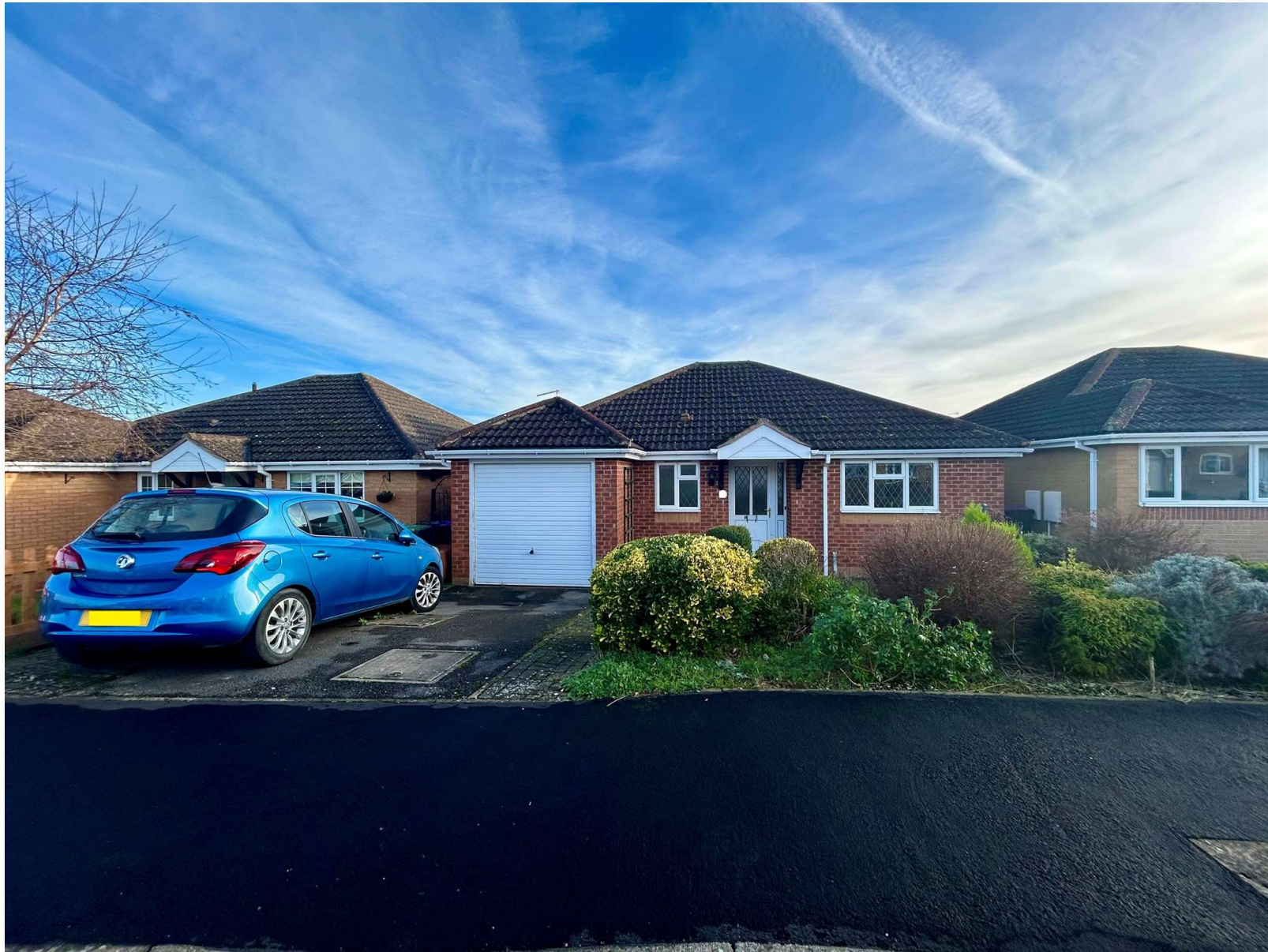
Hollowbrook Close, Ruskington Sleaford NG34 9GS