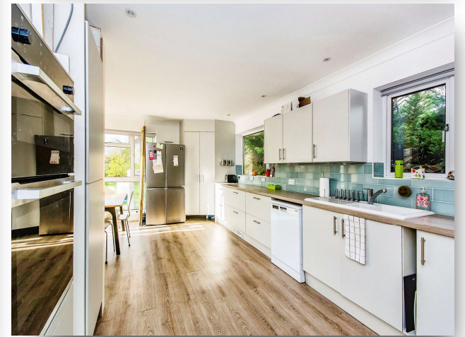
Lincoln Road, Ruskington Sleaford NG34 9AN