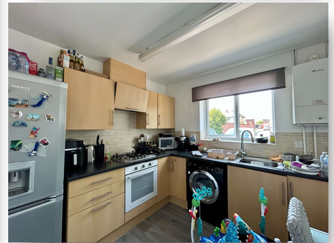
The Hedgerows, Sleaford NG34 8RE