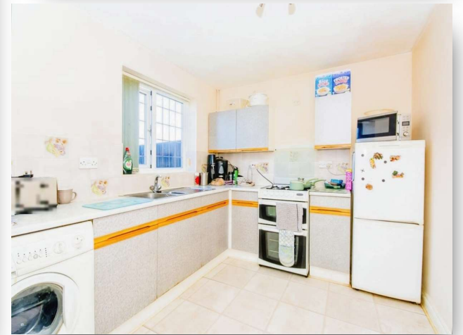
Read Way, Coningsby Lincoln LN4 4JX