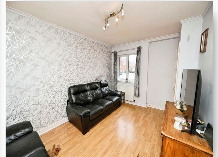
Winston Drive, SKEGNESS PE25 2RE