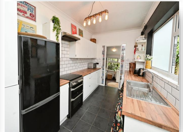
Wilford Grove, Skegness PE25 3EZ