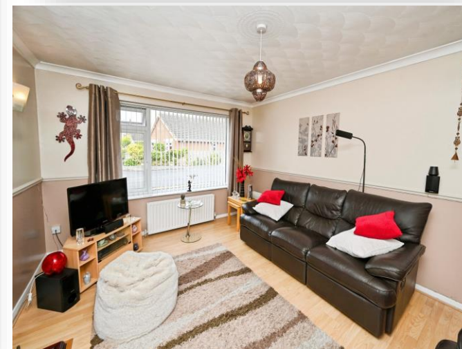
The Needles, Skegness PE25 1EQ