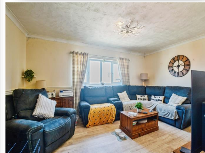
Clement Court Victoria Road,Mablethorpe LN12 2AJ