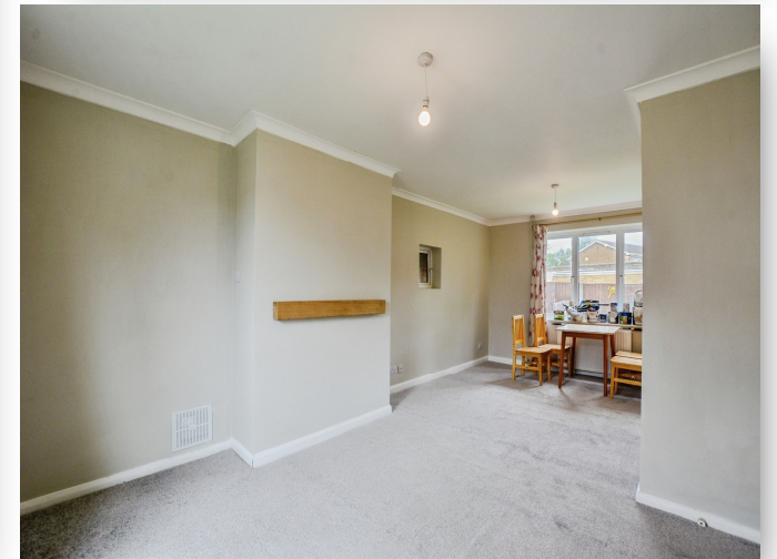
East View Close, Chapel St. Leonards Skegness PE24 5UP