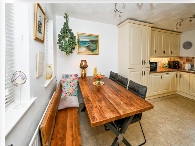
Foundry Mews, Burgh Le Marsh Skegness PE24 5HQ