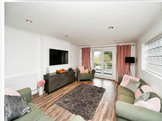
South Parade, Skegness PE25 3HW