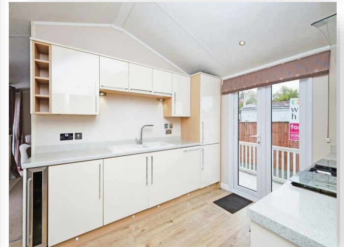
Riverside Holiday Park Wainfleet Bank, Wainfleet Skegness PE24 4ND