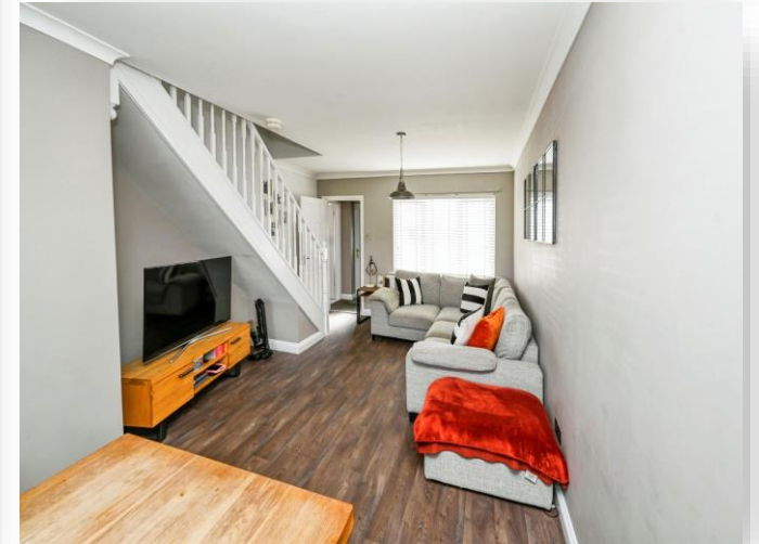
Kime Court, Skegness PE25 1EH