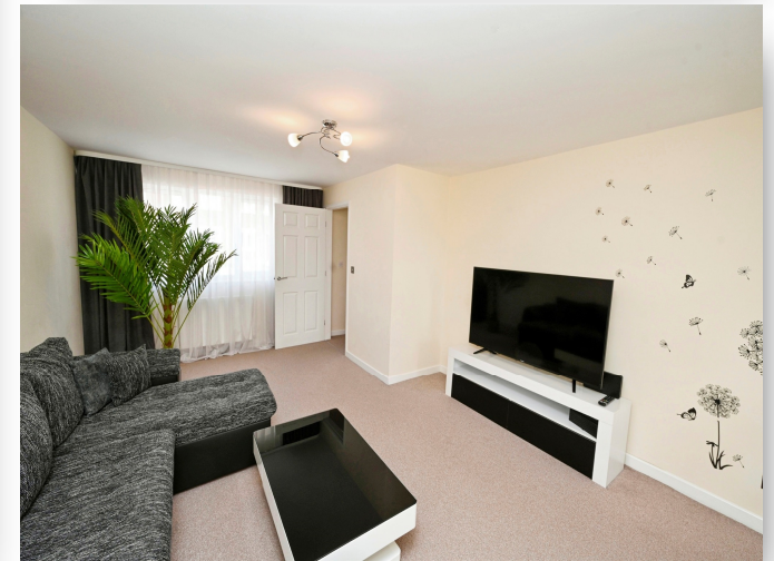
Churchill Avenue, Skegness PE25 2RN