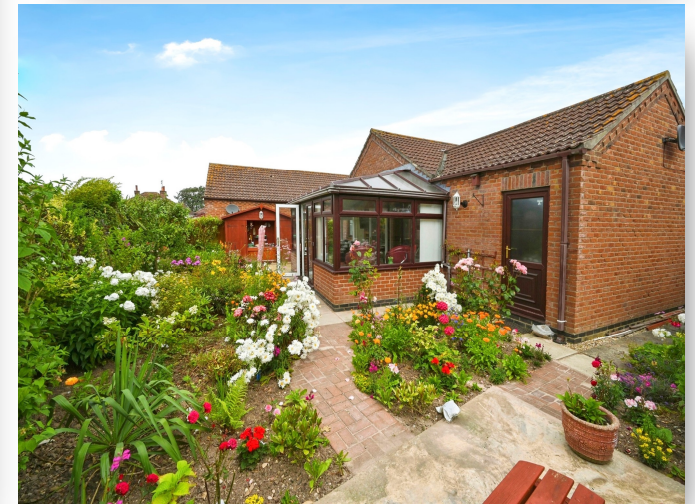
Keaton Close, Skegness PE25 2LL