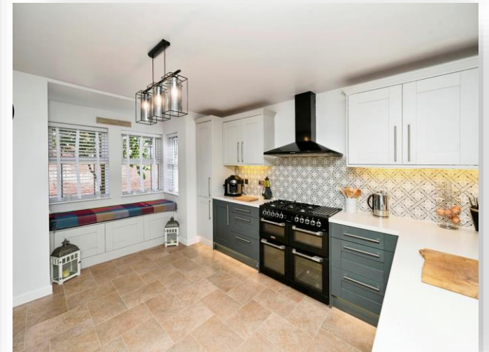
Hunters Meadow, Burgh Le Marsh SKEGNESS PE24 5FQ