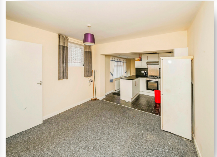
Roman Bank, Skegness PE25 1SG